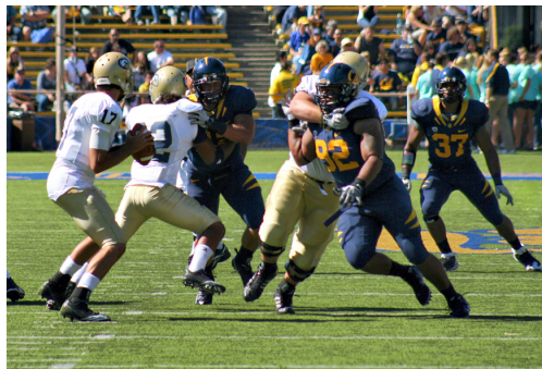
Figure 28.18 Momentum is an important concept for these football players from the University of California at Berkeley and the University of California at Davis. Players with more mass often have a larger impact because their momentum is larger. For objects moving at relativistic speeds, the effect is even greater.

In classical physics, momentum is a simple product of mass and velocity. However, we saw in the last section that when special relativity is taken into account, massive objects have a speed limit. What effect do you think mass and velocity have on the momentum of objects moving at relativistic speeds?